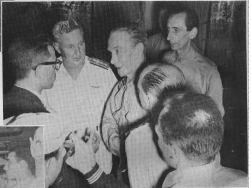
Admiral meets Galvao